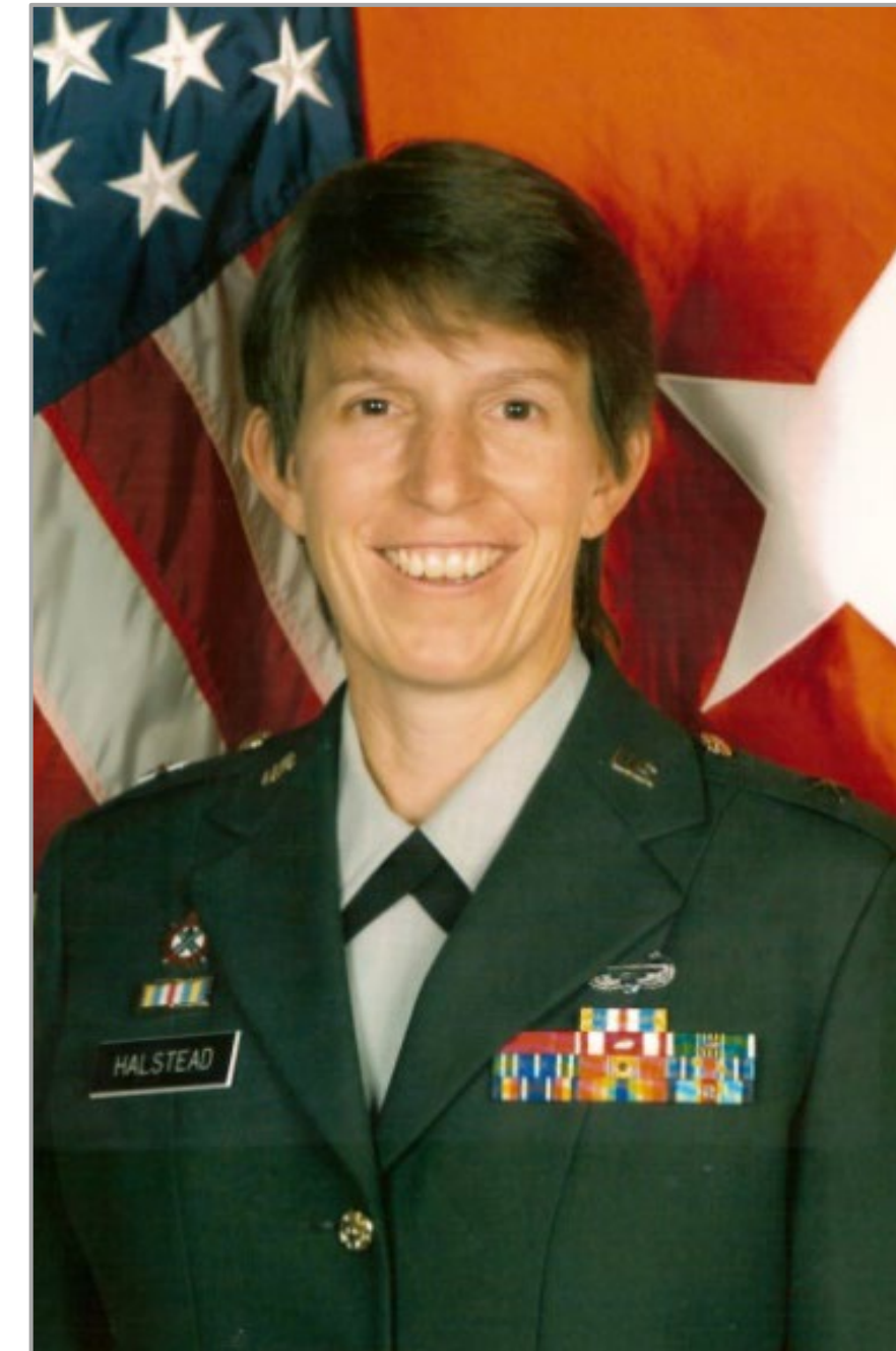
Be demanding, not demeaning