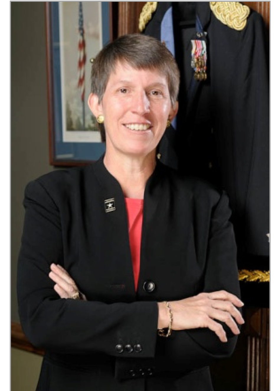
Teach, coach, mentor