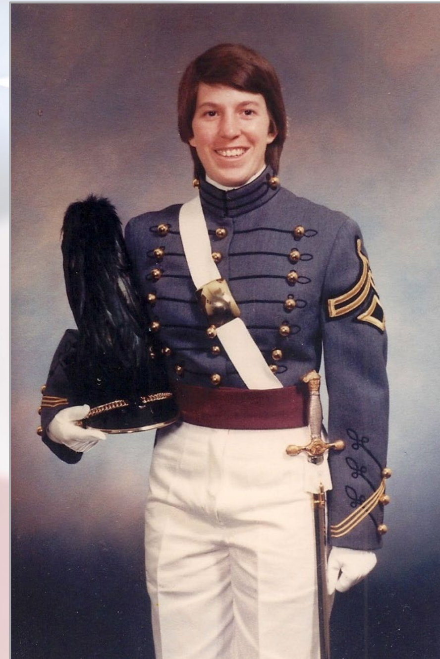
Be my best—live my values