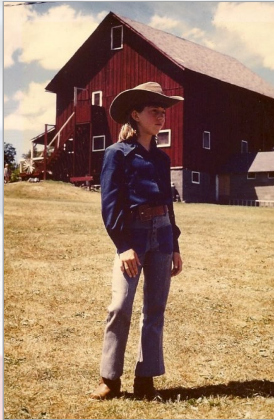
Country girl to Soldier